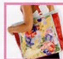
Lulu Bags Australia

Visit www.singaporefairs.com to search for products by category or browse our extensive list of vendors and their products.